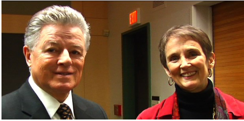
Gov. James Florio and Joanna Underwood, NJ AFV Conference

On January 24 th , Energy Vision and Rutgers University Eco-Complex co-sponsored a groundbreaking alternative fuel vehicle conference for the State of New Jersey. It was the first of many university-co-sponsored forums that we plan to hold in states where the need for clean alternative fuels is greatest, and where education of government leaders, businesses, civic