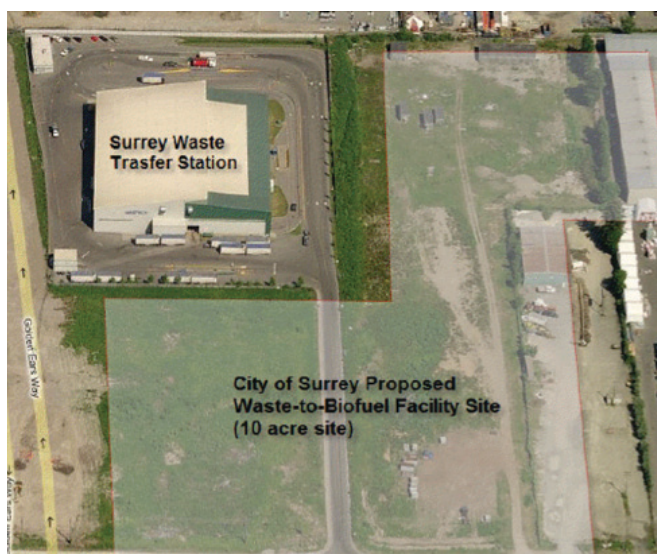
The new waste-to-biofuels processing plant will be in close proximity to the Surrey Waste Transfer Station, minimizing truck miles travelled, truck emissions, and fuel use.

This facility will have the capacity to process all of Surrey's organic wastes, including expected future increases. Upon its completion, the City intends to transport all of its organic wastes to its own facility. It will also accept commercial food waste from within the Metro Vancouver area, leading to enhanced