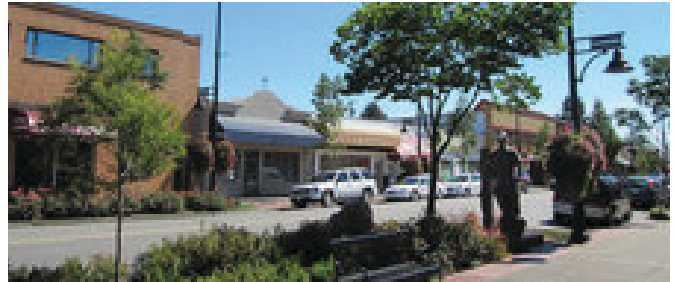
Surrey: Hub for clean energy businesses

disposal plan demonstrates its commitment to these interconnected goals.