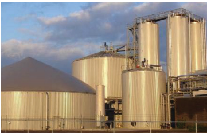
An anaerobic digester similar to the one expected to be built in Surrey.