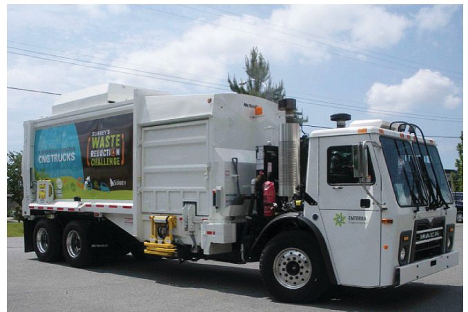
Surrey's pilot CNG refuse collection truck, currently in service. The new CNG trucks will be provided by BFI Canada and will go into operation in October 2012.

At present, the City has deployed one pilot CNG waste collection truck for its weekly curbside collection service. The vehicle is a low entry Mack truck with a 26-yard McNeilus side load body with cart-tipper and a Cummins Westport ISL G, 320 horsepower engine. BFI is currently considering